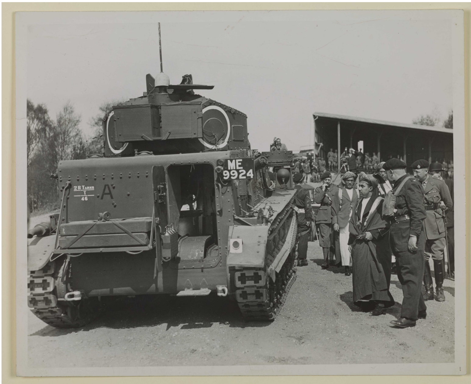
'The Sultan interested in the tanks after the demonstration' [1r] (1/2)